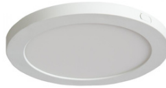
Halls / Closets