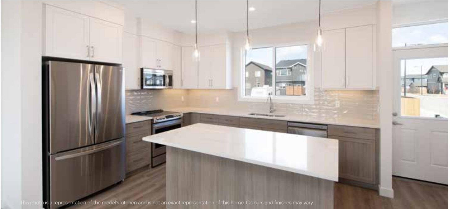
This photo is a representation of the model's kitchen and is not an exact representation of this home. Colours and finishes may vary.

Main 833 sq ft Second Floor 842 sq ft Total 1,675 sq ft